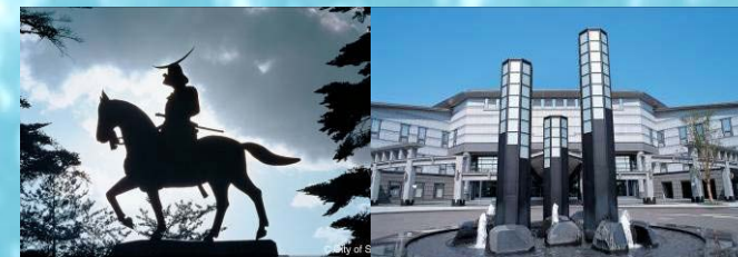
Sendai International Center